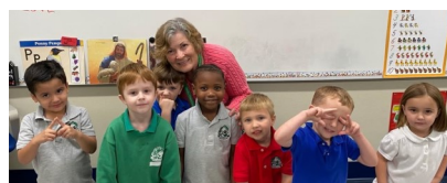
K3 learning to work together as they