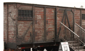
Cattle Car Exhibit

On Monday, February 24th, we had an event on OCA Campus with a holocaust exhibit. There were several dignitaries here for the opening ceremonies. Then, the exhibit was here all day. Many of our students and people in the community were able to visit the exhibit and learn more about that time in history.