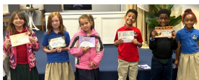
February third grade students of the month.

Students enjoyed the cupcakes they made to raise funds for the missionaries who will be coming to visit soon. Thanks to all who participated and those who brought cupcakes and items for decorating the cupcakes.